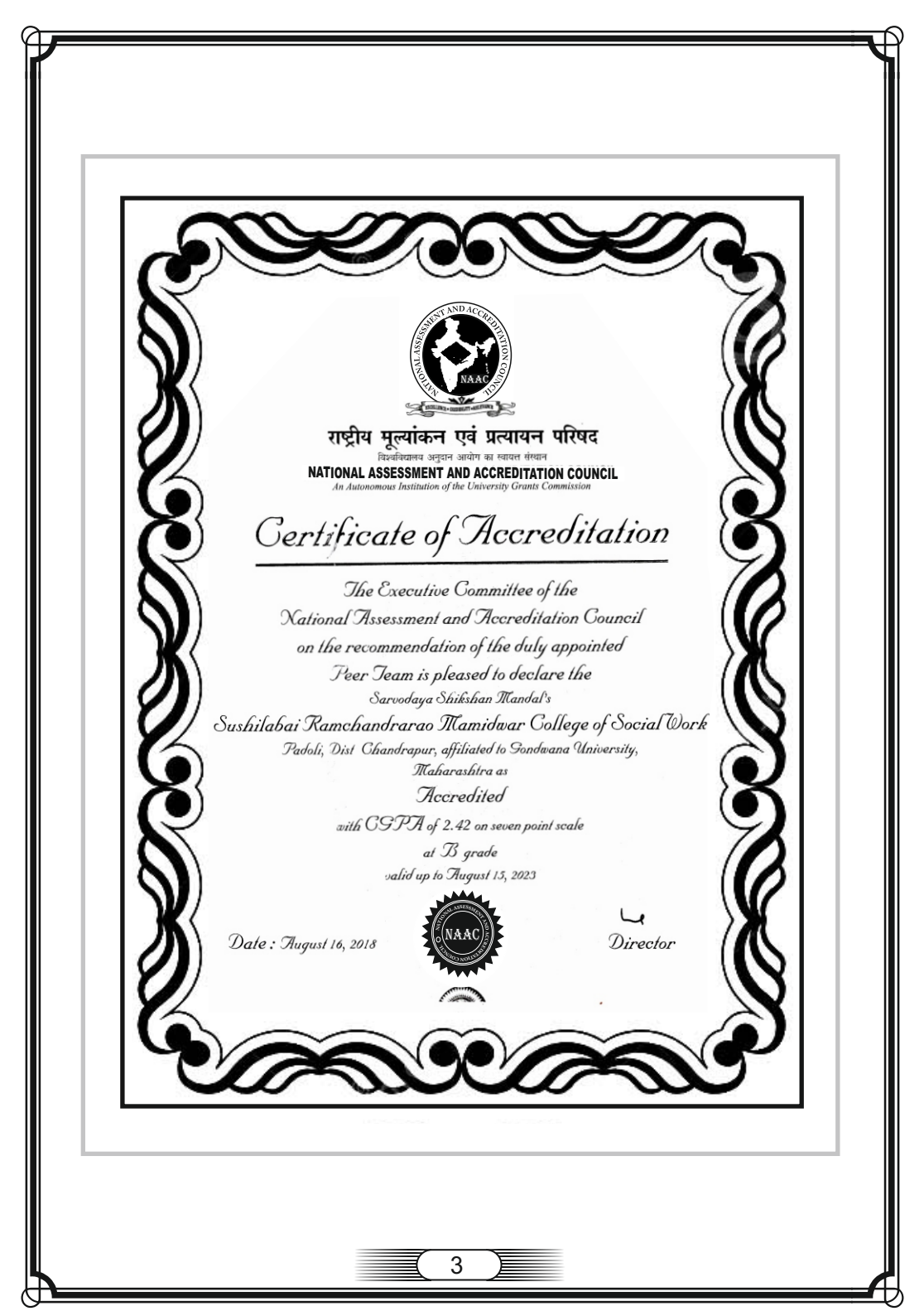
SRM College of Social Work, Chandrapur